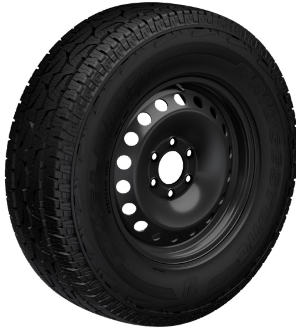
BRIDGESTONE ALL-TERRAIN TYRE